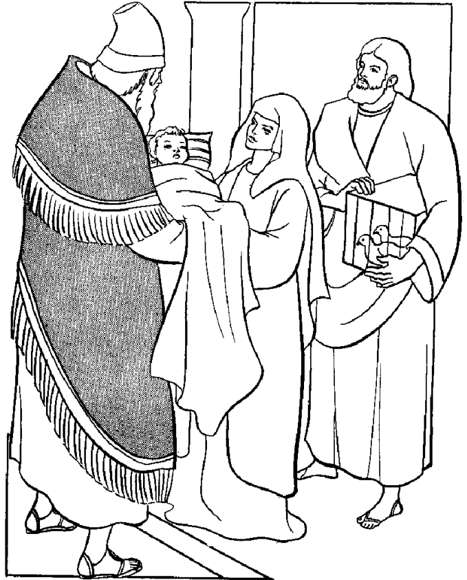
Presentation of Christ in the Temple